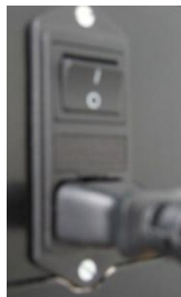
The main power connector