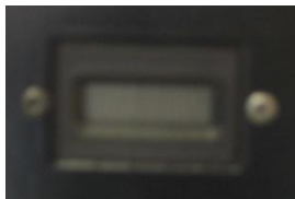
The cycle counter

At the backside of the degausser you will find the main power connector as well as the Cycle counter display. The Cycle counter display displays the number of cycles the degausser has performed in total. The display cannot be reset.